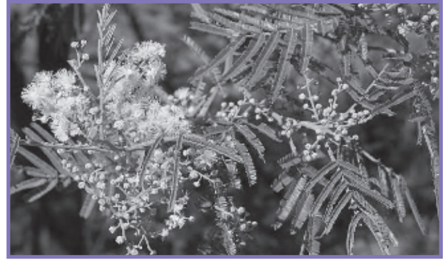
Swartwattel ( Acacia mearnsii ):

Biologiese beheer: Drie insekspesies wat hoofsaaklik saadproduksie teiken, is hiervoor beskikbaar; dus is dit 'n langtermynbeheermetode.