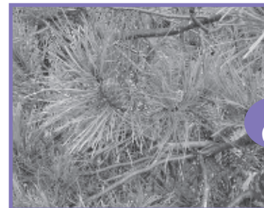
Denne ( Pinus pinaster ):