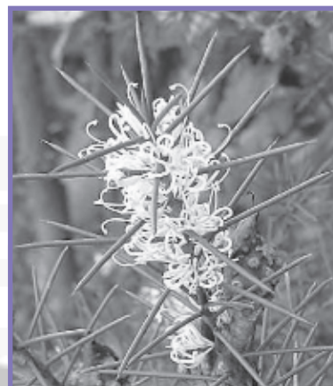
Syerige hakea ( Hakea sericea ):