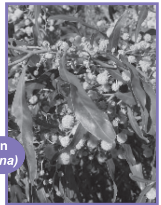
Port Jackson ( Acacia saligna )